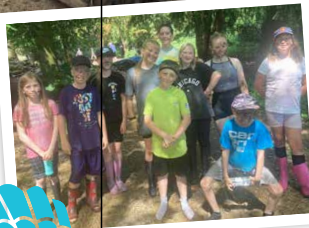
Fifty-two year 6 children from Wroughton camped at Whitwell Hall near Norwich. They enjoyed a range of activities including creating natural art, orienteering, river dipping, and den building.