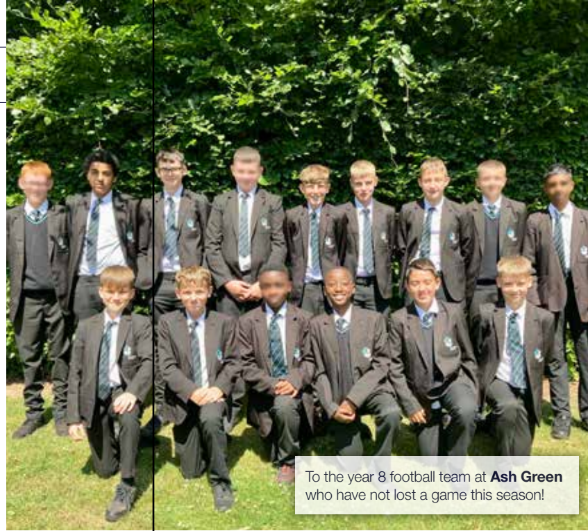
To the year 8 football team at Ash Green who have not lost a game this season!