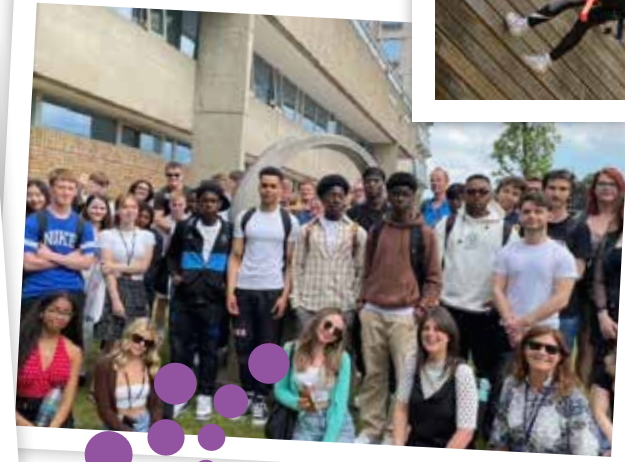
Fifty-six year 12 students from Abbeyfield went to the University of Leicester for a university taster and careers insights day. The programme included lectures on a range of topics including volcanoes, films that changed the world, and laboratory drop-ins for those wanting to do biology and chemistry. Students also attended a "fighting talk" drama workshop and found out more about different routes into careers.