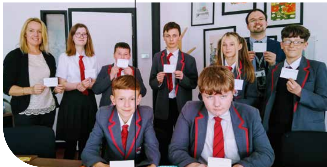
To the year 9 scholars at Hart for their exhibition focusing on the representation of diversity and LGBTQI+ through time. The curator at the V&A Museum who leads on this topic wants to showcase the group's work as part of the museum's celebration of Pride.