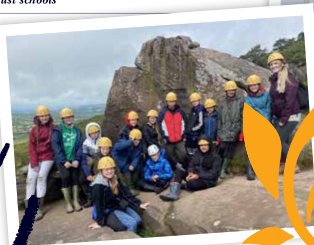
Year 6 students at Harfield demonstrated "The Harfield Way" during their residential to Stanley Head. Students enjoyed campfire songs, s'mores, reflection time around the campfire, and the opportunity to develop essential life skills. The school was very proud of the students for pushing themselves out of their comfort zones and displaying excellent attitudes and behaviours.

This summer has seen a return of school trips, residentials, and performances. In this issue, we celebrate the activities and events that have been happening across our schools.