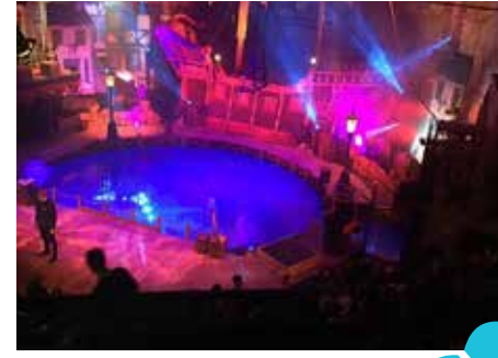
During the first week of the summer term, Wroughton took all children from Reception to year 6 to see the "Pirates Live!" action water show at the Hippodrome Circus in Great Yarmouth.